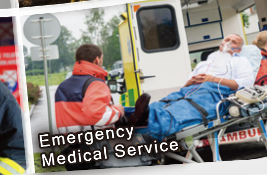
Emergency Medical Service